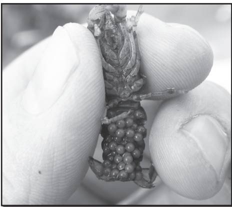
Female Golden Crayfish ( Orconectes luteus ) “in berry.”

Depending on the species, crayfish in Missouri grow to a size of one to seven inches. The smallest species is the Neosho midget crayfish and the largest is the long-pincered crayfish. Growth slows during the winter when energy is being used for reproduction. It is believed that most crayfish live two to three years with a few exceptions. Cave species are long-lived and data suggest they can live 10 to 15 years. Another exception is the giant freshwater crayfish of Tasmania. It is the largest freshwater invertebrate in the world and can live up to 50 years.