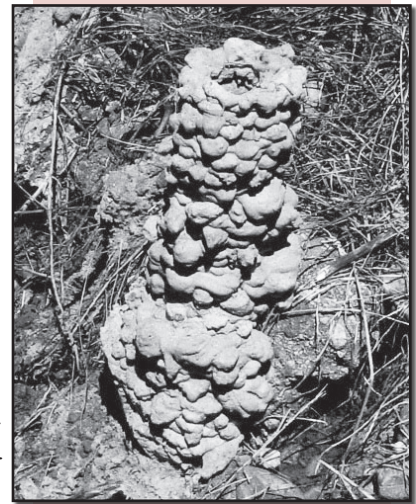
Mud “chimneys” are telltale indicators of burrowing crayfish.