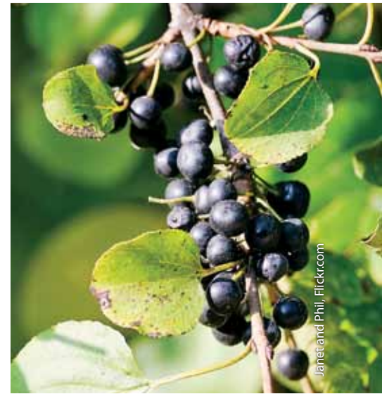
Spread by birds, seeds from the dark fruit give rise to new plants.