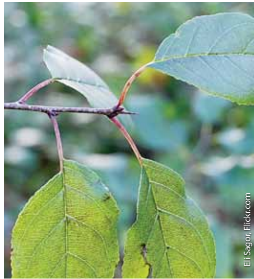
Opposite to nearly opposite leaves, with a terminal bud modified into a thorn, help to identify common buckthorn.