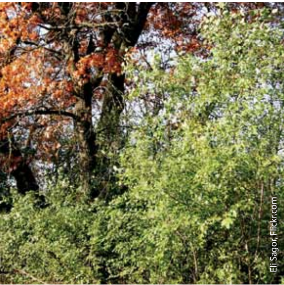
Leaves emerge early in spring and remain green through fall, creating dense shade.