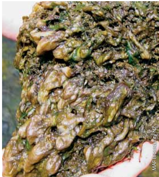
MAF Biosecurity NZ