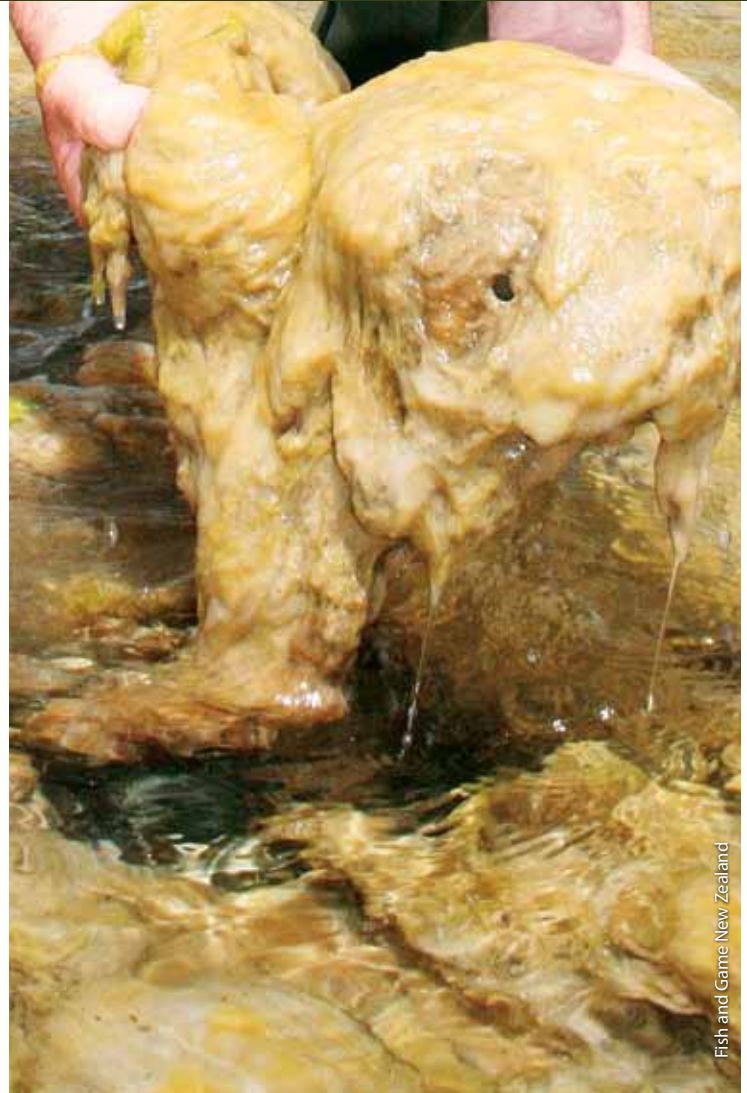
Fish and Game New Zealand

Even though didymo is one of the largest freshwater diatoms, the individual cells cannot be seen with the naked eye. Only one cell is needed to establish a colony. Newly established didymo colonies are characterized by small, thick, brown bubbles on rocks. It can appear slimy, but actually feels like wet cotton or scratchy wool. The longer the colony persists, the longer the filaments become. These filaments detach and float downstream like a flotilla of tissue paper, thereby spreading the invasive organism.