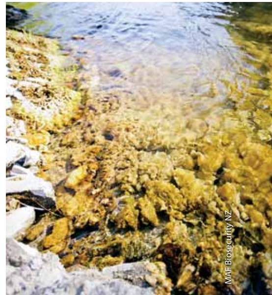
MAF Biosecurity NZ