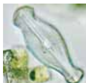
Dr. Russell Rhodes

Felt-soled waders and wading boots, worn by many trout anglers, appear to be a likely pathway for the spread of didymo. Felt soles are porous and hold moisture for days. A single cell of didymo can survive in the sole of the boot. Didymo can then be introduced unknowingly to the next stream the angler visits. In addition to waders and angling equipment, canoes, kayaks and other watercraft are also considered pathways for didymo to spread.