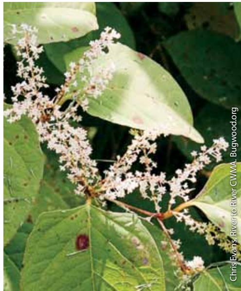
Clusters of white to greenish flowers occur midsummer.