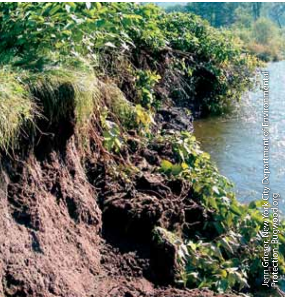
Erosion of stream banks dominated by Japanese knotweed. Rhizomes break off and colonize stream banks downstream.