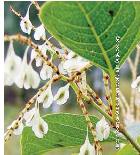
Reddish, jointed stems and winged seeds help identify Japanese knotweed.