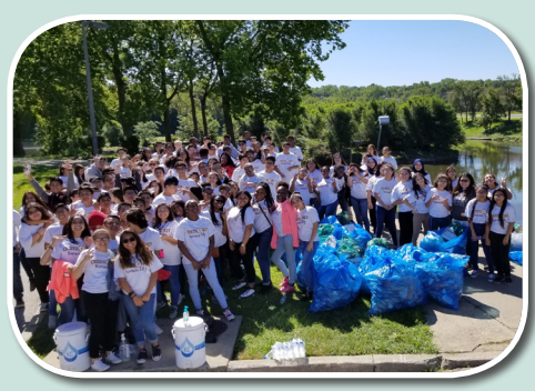
Stream Team 5390 removed more than 450 pounds of trash from Brush Creek in Jackson county.