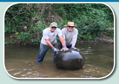
Stream Team 3 had an unusual find, a pipeline sphere, on the Bourbeuse River during the 51st annual Operation Clean Stream.