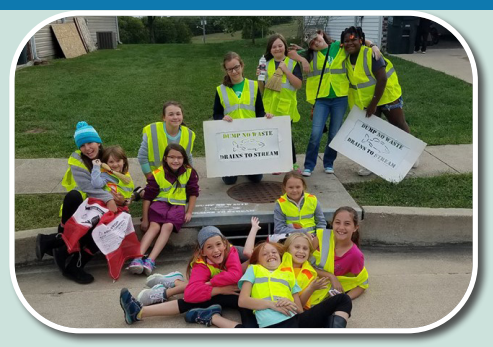
Girl Scouts with Stream Team 5254 stenciled the storm drains in a local neighborhood in Fulton.