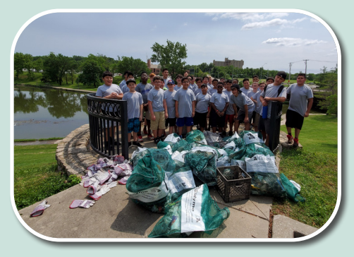
Stream Team 5390 proudly display their haul from Brush Creek in Jackson County.