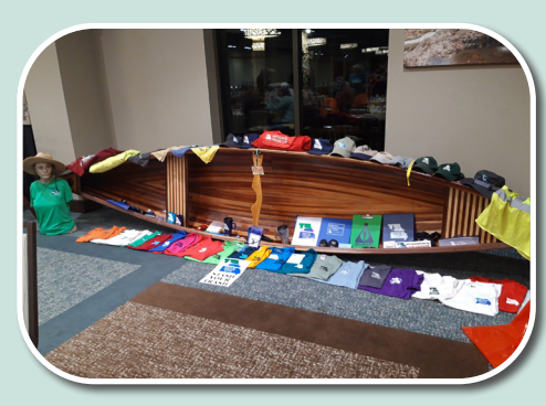
An assortment of Stream Team swag from over the years on display at the 30th Anniversay celabration courtesy of Team 211.