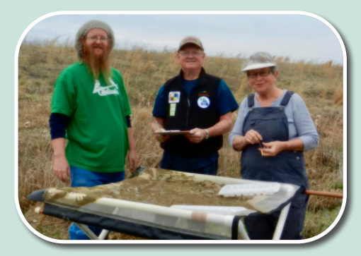
Streams Team 5692 look for macroinvertebrates in Spring River in Jasper County.