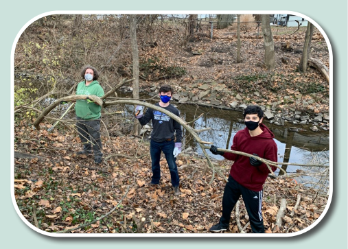
ST4540 and Ladue Horton Watkins High School clear invasive honeysuckle from Black Creek in St. Louis County.