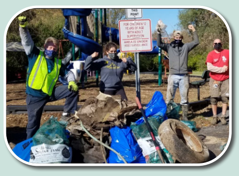
ST5863 with their impressive trash haul from Gravois Creek in St. Louis County.