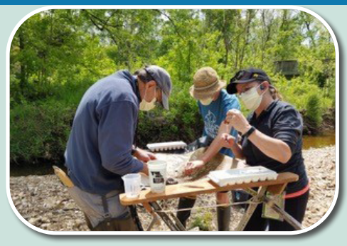
ST2504 performs biological monitoring on Clear Creek in Boone County while practicing safety protocols due to the pandemic.