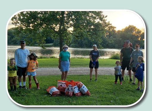
ST728 and a small group of volunteers clean Shelbina Lake in Shelby County.