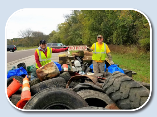
ST5863 - Members of Team 5863 stand with their impressive haul from the Meramec River in Buder Park.