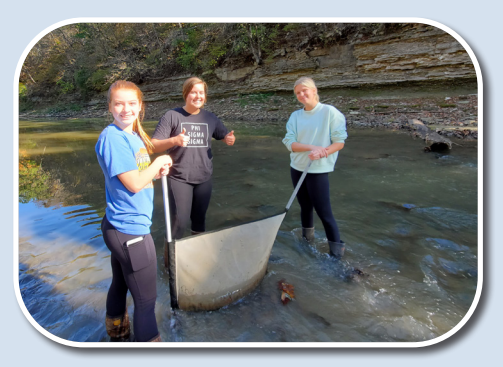
ST2608 - Quincy University Ecology Class monitoring the Wyaconda River for macroinvertebrates.