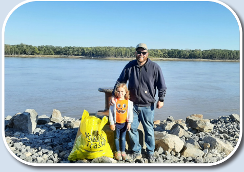
ST3206 - Team 3206 were happy to have members of the public join in on their cleanup of the Mississippi River while they were out.