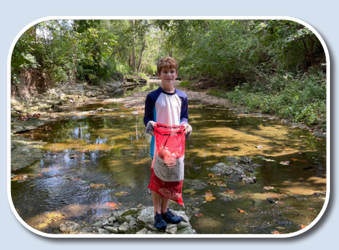
ST6011 - A young member from Team 6011 displays his finds from Fishpot Creek in St. Louis County.